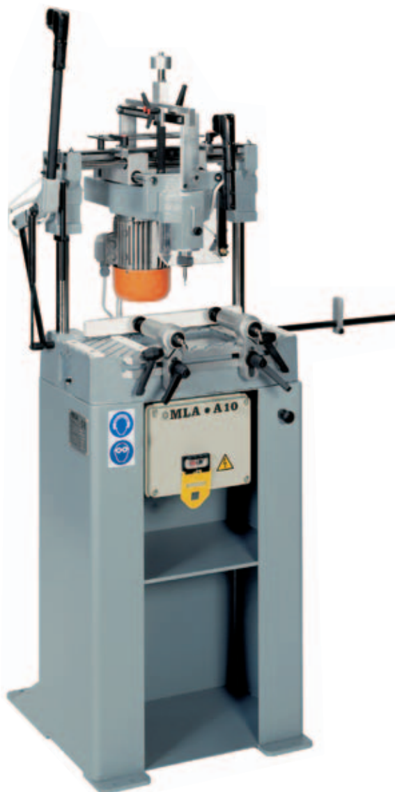
A10CE - code 100451