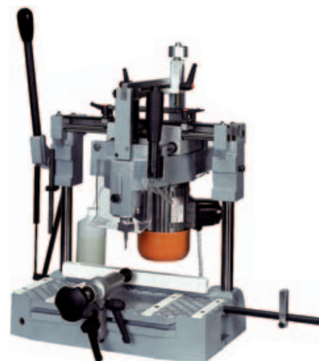
A10M - code 100451.M